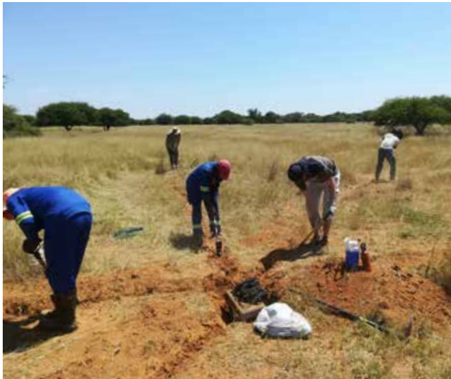
A moisture probe network consisting of eight sensors attached to a central unit has been installed at each site so that satellite-derived soil moisture data can be validated.

During the recent field campaign, a moisture probe network was also installed in each of the six study sites so that the soil moisture data derived from Sentinel-1 radar imagery can be validated. Each network consists of eight sensors placed in a 20 x 20 m area and attached to a central unit. Since these need to be protected from vandalism or theft, and the data downloaded every three months, they have been installed either in national parks or on the property of willing landowners. More specifically, one is at the Kruger National Park's sampling station near Lower Sabie, where there are a number of other monitoring instruments, another in Mokala National Park and a third in Augrabies National Park, while the others are on private farms near Pilanesberg, Ladybrand and Elim near Cape Agulhas.