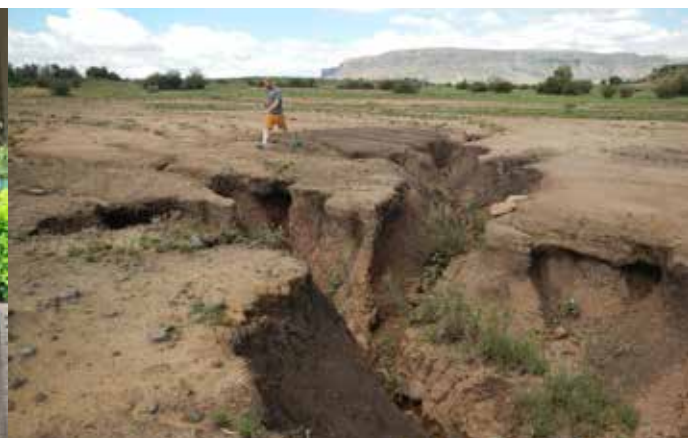
Some erosion gullies in the study sites have been surveyed using drones, and the resulting digital terrain models will allow changes to be monitored over time.

"At the end of the project we'll fly these areas again to see how things have changed," he says. "We're doing that mainly in the national parks because – given that they are directly protected by park management – it's basically just the rainfall or run-off signal that creates the dynamics of the gullies. In certain areas they are not a sign of land degradation, but we want to learn how they evolve naturally."